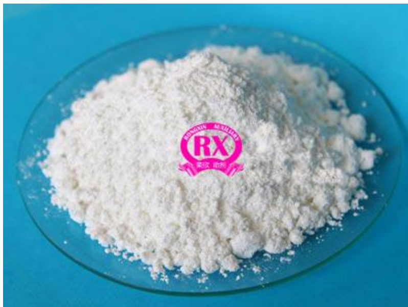
Rubber Accelerator DETU