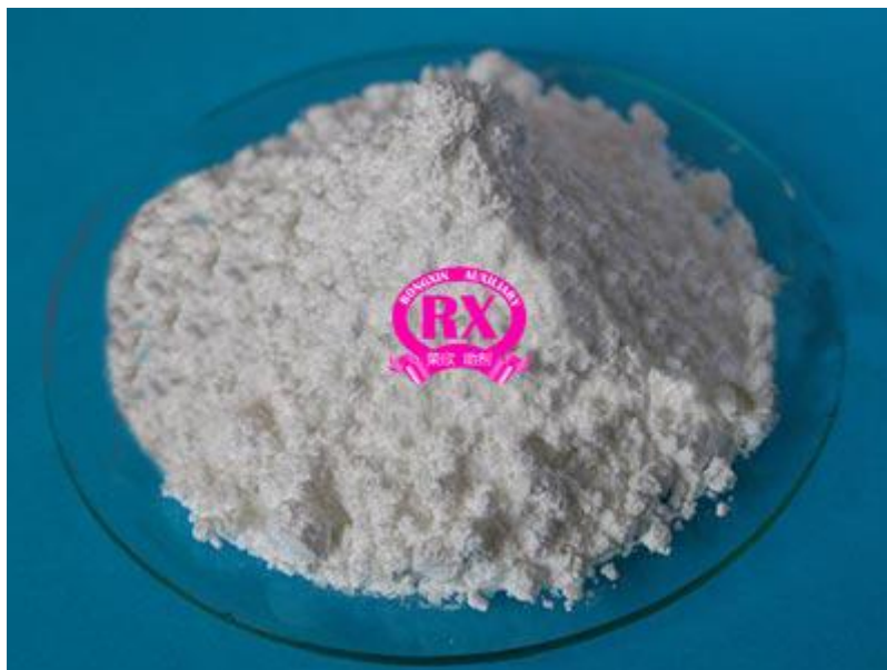
Rubber Accelerator ETU(NA-22)