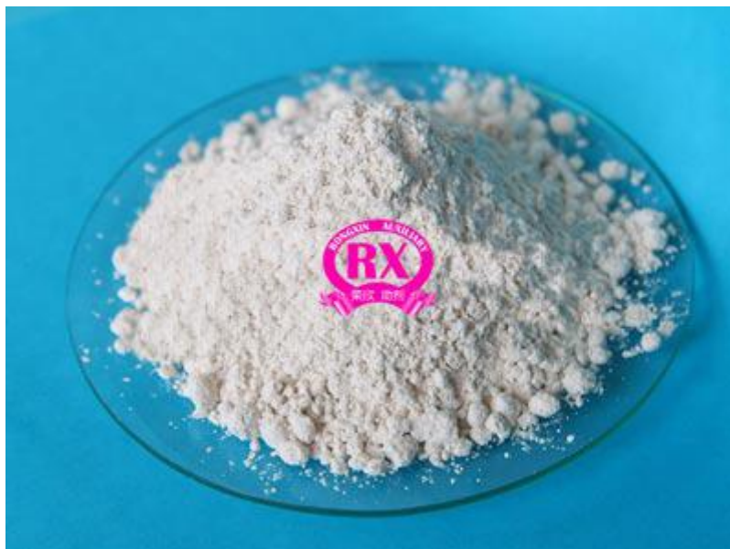
Rubber Accelerator DPG (D) powder